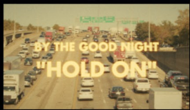
Jan 2025 Hold On

They were hand-selected from over 1,000 entries to perform on the main stage at Fort Worth Arts Goggle festival, won the Texas Watuaga Fest with 88.1 Indie in May, and have been featured on the front page of KXT. Their debut EP Circular Thoughts arrived January 9, 2026 on digital and CD, with a vinyl edition following in March 2026. By The Good Night are poised to become one of indie rock most exciting new acts.