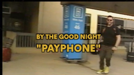
April 2025 Payphone